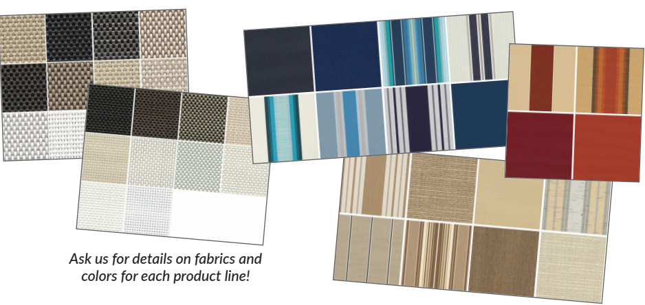
Ask us for details on fabrics and colors for each product line!