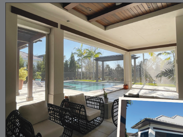
No See Um Tuffscreen