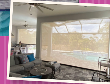
Suntex 95% white

Your Florida resource for everything to keep you cool in summer, and warm in winter!