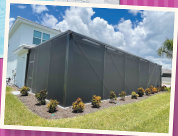
SheerWeave 99% Charcoal Chestnut