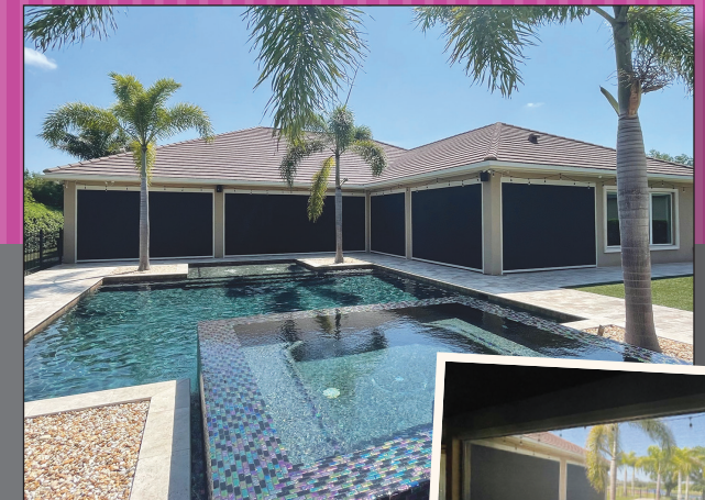
Suntex 95% black