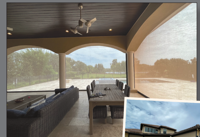
Suntex 95% Mocha