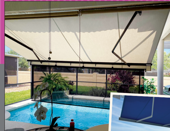
Sunbrella fabric awnings